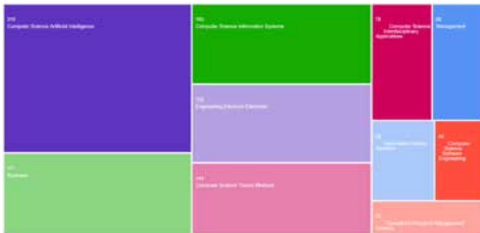
Figure 2. Distribution of papers by Web of Science category.

Most articles were published in the Computer Science Artificial Intelligence Web of Science category (310), followed by Business (171) and Computer Science Information Systems (160).