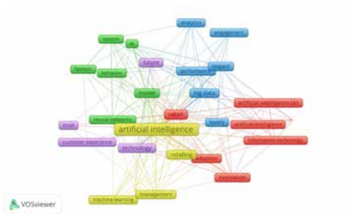
Figure 4. Keyword with at least three co-occurrences