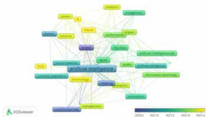
Figure 5 Evolution of keywords in the last three years.