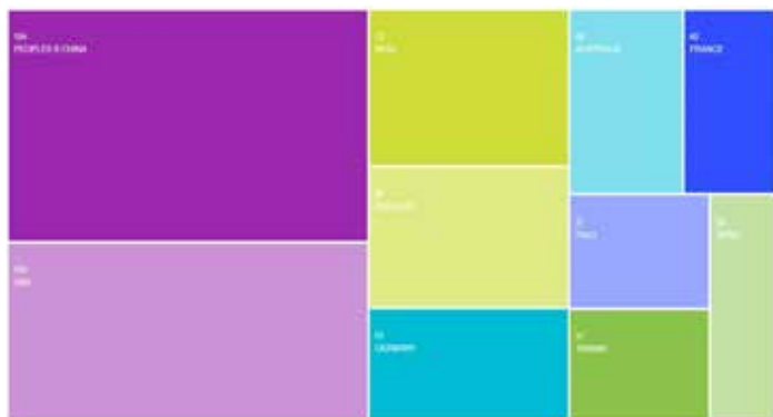
Figure 3 Distribution of papers by country.

The countries with the largest number of digitalization papers published are the People's Republic of China (194) and the USA (150), followed by India (73) and England (65).